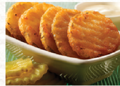
Pickle Chips Battered Fred's, 6/2 lb #700323