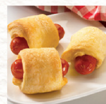
Cocktail Franks in Puff Pastry #853017, 1/100 ct

Mini Angus burger on a brioche roll dressed with sautéed onion, mustard, pickle, and Swiss cheese, then topped with our own special dressing. Les Chateaux