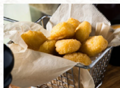
Corn Nuggets Battered Golden Crisp, 6/2 lb #801507