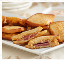
Sandwich Mini Reuben #851093, 1/60 ct

Choice beef that's cubed and marinated with freshly cut onions, mushrooms, and red peppers, woven onto wooden skewers Les Chateaux