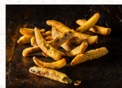
Spicy Battered Pickle Fries Anchor, 4/3 lb #801633