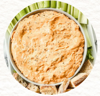
Buffalo Chicken Dip JTM, 4/5 lb #692072