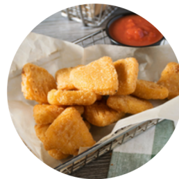
Macaroni & Cheese Wedge Anchor, 6/3 lb #801601