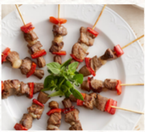
Beef Skewers #851257, 1/50 ct

Choice beef that's cubed and marinated with freshly cut onions, mushrooms, and red peppers, woven onto wooden skewers Les Chateaux