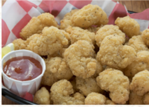
Buttermilk Popcorn Shrimp 60/90 Mrs. Friday's, 4/2.5 lb #962039