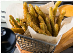
Green Beans Battered Fred's, 6/2 lb #994996