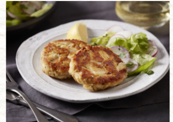
Crab Cake Premium Phillips, 12/4 oz #191219