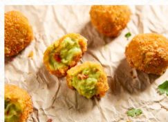
Guacamole Bites Breaded Revel, 6/2 lb #802009