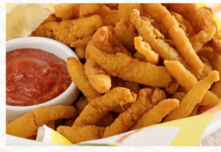
Breaded Clam Strips Sea Watch, 1/6 lb #191309