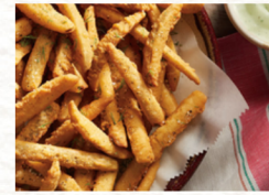
Pickle Fries Breaded Harvest Creation, 5/2 lb #960034