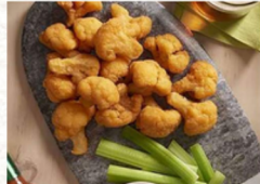
Cauliflower Battered Crispy Harvest, 4/3 lb #960033