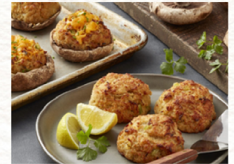
Crab Cake Tavern 3 oz Phillips, 1/4.5 lb #960907