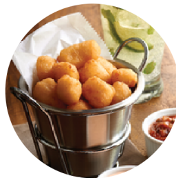
Battered White Cheddar Nuggets Fred's, 6/2 lb #801517