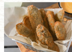
Dill Pickle Spears Breaded Anchor, 4/4 lb #801614