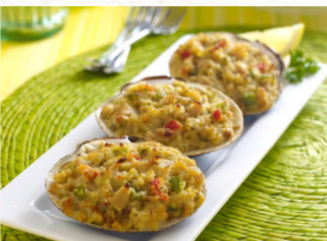
Premium Stuffed Clams Sea Watch, 36/2 oz #191293