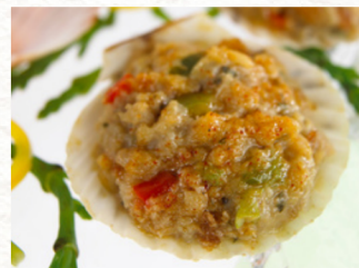
Gourmet Clams Casino Kaptain's Ketch, 56/.75 oz #961017