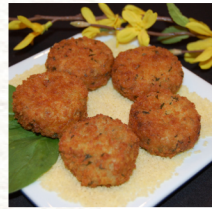
Risotto Ball Mushroom Fried #931025, 1100/0.75 oz

Fillo dough bundles stuffed with buttery, smooth French brie, fresh raspberry jam, and toasted almonds. Les Chateaux