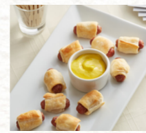
Cocktail Franks in a Blanket #853002, 1/100 ct

These sandwiches feature the classic Reuben: New York-style rye bread, Swiss cheese, sauerkraut, corned beef, and Russian dressing. Les Chateaux