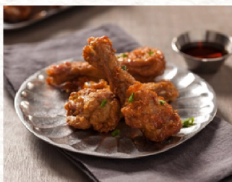
DUCK WING DRUMMETTES FC #009761, 5/2 LB