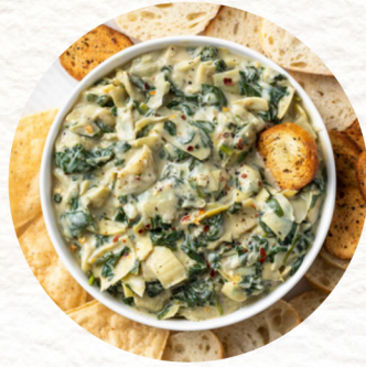
Spinach Artichoke Dip Anchor, 36/6 oz #801600