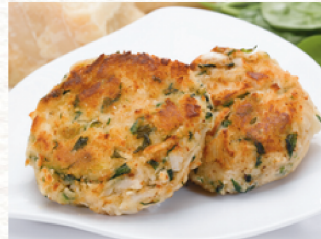
Crab Cake Slider Blue Crab Stone Silo, 64/3 oz #970003