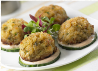
Crabcake Maryland .75 oz Phillips, 100/.75 oz #960906