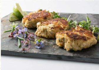
Seafood Cake (Shrimp, Crab, Scallop) 3 oz Stone Silo, 4/6 lb, #970002