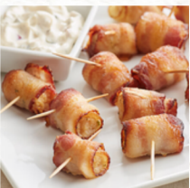
Bacon Wrapped Scallop #931703, 1/100 ct

Plump, tender 40/60 scallops are dipped in extra virgin olive oil, lemon juice, garlic, salt, pepper and spices then coated with bread crumbs and wrapped in bacon. Les Chateaux