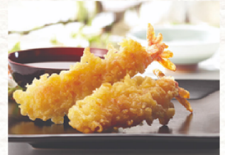
Shrimp Tempura 21/25 Tail On Aqua Star, 4/2.5 lb #480537