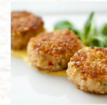
Mini Blue Claw Crab Cake #931733, 1/100 ct

Plump, tender 40/60 scallops are dipped in extra virgin olive oil, lemon juice, garlic, salt, pepper and spices then coated with bread crumbs and wrapped in bacon. Les Chateaux