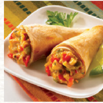
Chicken & Cheese Quesadilla Cone #862037, 4/25 ct

These quesadillas feature cornucopia-shaped flour tortillas that are stuffed with chicken, scallions, cheddar cheese, corn, onions, and red and green peppers. Les Chateaux