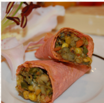
Vegetable Quesadilla #851045, 1/50 ct

This cone shaped tortilla is filled with Cheddar and Monterey Jack, heavy cream, onions, scallions, red and green peppers, coriander & spices. Les Chateaux