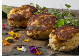
Spinach Parmesan Crab Cake Stone Silo, 64/3 oz, #970002