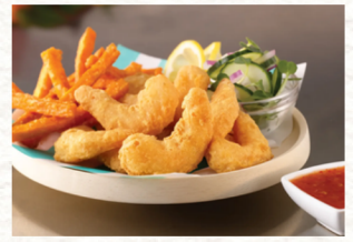
Golden Ale Beer Battered Shrimp 31/35 Trident, 1/10 lb #960627