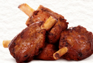
PORK WINGS FC 1/11 LB, HATIFELD #091238