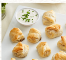
Mini Beef Wellington #931715, 1/100 ct

An All-American favorite! A kosher all-beef cocktail frank wrapped in a flaky pastry puff dough blanket. Spring Valley