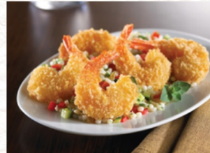
Breaded Shrimp 16/20 Cooked Mrs. Friday's, 6/2.5 lb #480531