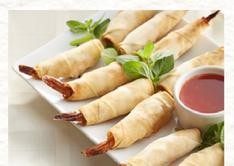
Shrimp in Jacket Tail On 31/35 Les Chateaux, 1/100 ct #961967