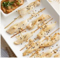
Chicken Satay #851256, 1/100 ct

Hand cut chicken strips, not marinated, are woven on a wooden skewer. Les Chateaux