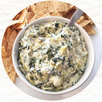
Spinach Artichoke Dip Stouffers, 4/64 oz #860579