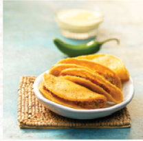
Mini Chicken Tacos #152070, 4/4 lb

Hand cut chicken strips, not marinated, are woven on a wooden skewer. Les Chateaux