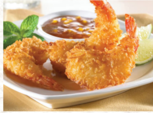
Breaded Coconut Shrimp 16/20 Round King & Prince, 4/2.5 lb #480525