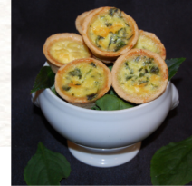
Mini Spinach Florentine Quiche #931732, 1/100 ct

Fillo dough that's been wrapped around tender asparagus and caramely asiago cheese, finished with paprika and asiago cheese shreds. Les Chateaux