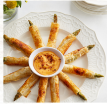
Asparagus in Fillo Dough Asiago #931710 1/100 ct

Our own mini rice balls with a melty smoked Gouda cheese center. Bake and serve. Simply Cuisine