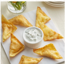
Buffalo Chicken Wonton #929999, 1/50 ct

Seasoned breast meat is skillfully wrapped around a freshly made filling (blended Swiss/American cheeses and diced Canadian style ham) coated with crunchy bread crumbs and par fried. Koch