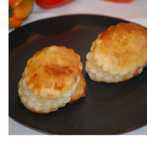
Pastry Puff Brie & Apricot #931769, 1/100 ct

These hand made hors d'oeuvres are filled with spinach, Feta cheese, cream cheese, fresh whole eggs, sauteed onions & seasonings & wrapped in fillo. Les Chateaux