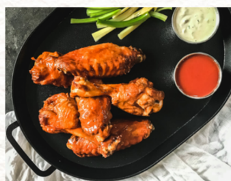
TURKEY WINGS FRZ 5LBA #820517 TURKEY WINGS BABY 30 LBA, #007829