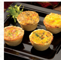
Assorted Mini Quiche #960930, 1/100 ct

Stuffed Apricots, wrapped with Pancetta. Les Chateaux