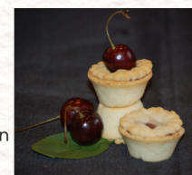
Cherry Short Rib Pot Pie #929998, 11/100 ct

A mini hoagie roll filled with thinly sliced sautéed beef and onions, mixed with cheese, then topped with shredded mozzarella. Les Chateaux