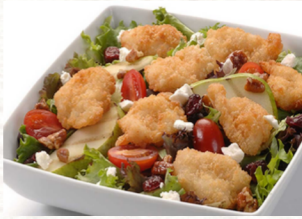
Shrimp Breaded Pieces Large Tampa Maid Foods, 4/3 lb #681630