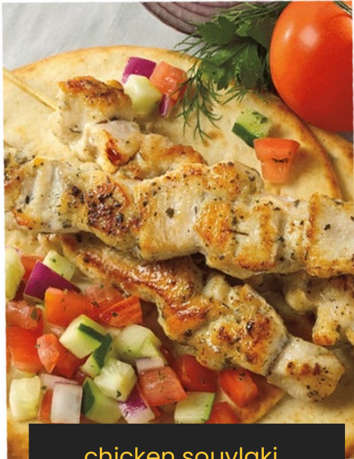
chicken souvlaki #851032, 30/5 oz