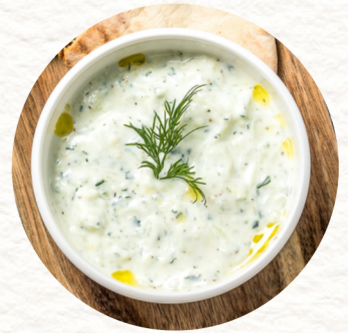
Tzatziki Sauce Grecian Dip Olympia, 4/64 oz #080412