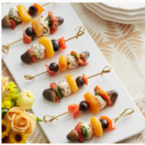
Antipasto Skewer Vegetarian #931772, 50/ea

Mozzarella cheese, marinated red peppers, black olives, mushrooms, sun dried tomatoes, dried apricots, and basil, woven onto a knotted skewer. Les Chateaux