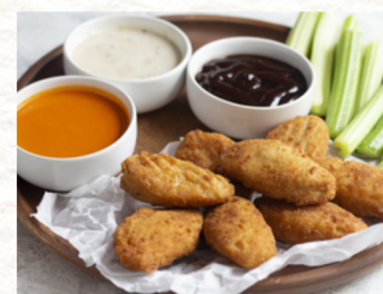
MEATLESS WING BONELESS 2/4 LB, QUORN #353567