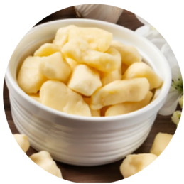
Cheese Cheddar Curds Fred's, 4/2.5 lb #030631