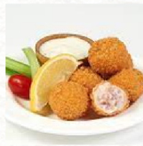
Mini Chicken Cordon Bleu #400400, 2/5 lb

These skewers feature tender white meat chicken and fresh apricot brushed with apricot glaze and wrapped with bacon. Les Chateaux