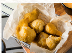
Mushroom Breaded Anchor, 6/2.5 lb #801602