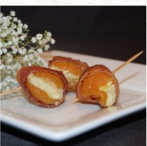
Cherubs on Horseback #996994, 1/100 ct

Stuffed Apricots, wrapped with Pancetta. Les Chateaux