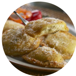
Ravioli Breaded Cheese Toasted Rosina, 1/10 lb #371274