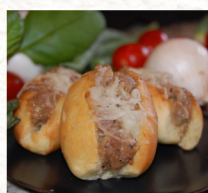
Mini Philly Cheese Steak Hoagie 1/60 ct, #931735

Fresh Choice beef tenderloin with mushroom duxelle and liver pate wrapped in an all-butter puffed pastry, prepared in the thru Wellington. Les Chateaux