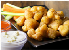
Cauliflower Battered Fred's, 6/2 lb #801516