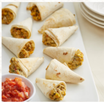
Smoked Chicken Quesadilla #680430, 50/1 oz

Stuffed With A Delicious Three Cheese Blend (mozzarella, Roquefort And Cream Cheese), White Meat Chicken And Mild Hot Sauce. Amoy