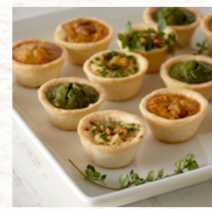
Assorted Mini Quiche #851009, 1/100 ct

An assortment of favorite quiche flavor profiles, including Lorraine, garden vegetable, broccoli & cheese and three cheese. Spring Valley