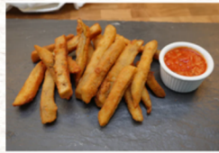
Eggplant Fries Battered Vertullo, 2/5 lb #731562