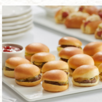
Mini Angus Cheeseburgers #931711, 1/60 ct

Tender unseasoned beef strip ribboned onto a wooden skewer. Add your own sauce or marinade. Spring Valley