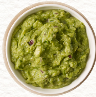
Western Style Guacamole Tomato, Onion, Cilantro Bag Calavo, 4/3 lb #841213