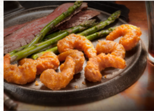
Guinness Beer Battered Shrimp 26/30 Icelandic, 1/10 lb #801808