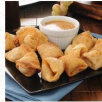
Buffalo Chicken Wonton #996473, 120/1 oz

These wontons feature tender, juicy chicken with blue cheese, mozzarella, hot sauce, and butter, all wrapped in wonton wrappers. Les Chateaux