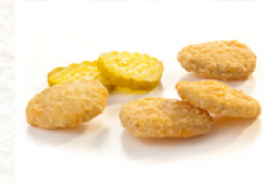
Crispy Tempura Pickle Chips Cavendish, 4/2 lb #700287