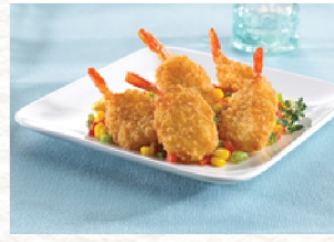
Breaded Shrimp 31/40 Mrs. Friday, 12/6 oz #480515