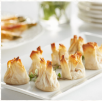
Brie with Raspberry Jam #851041, 1/48 ct

We prepare this delicious dish with French brie cheese, toasted almonds and apricot jam in our all-butter puff pastry dough. Les Chateaux