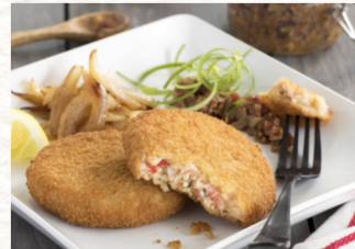
Crab Cakes Oven Ready Mrs. Friday, 4/5 lb #960901