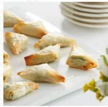
Spinach & Cheese Spanakopita #931706, 2/80 ct

Mozzarella cheese, marinated red peppers, black olives, mushrooms, sun dried tomatoes, dried apricots, and basil, woven onto a knotted skewer. Les Chateaux