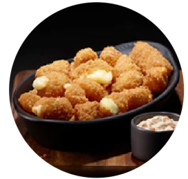
Breaded Cheese Curds Anchor, 2/5 lb #801638: Original #940328: Spicy