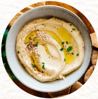
Hummus 64 oz Grecian Delight, 4/3.75 lb #853014