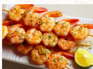
Shrimp Skewers Tail On 16/20 Icelandic, 4/2.5 lb #960011