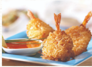
Coconut Panko Breaded Butterfly Shrimp 16/20 Ocean Horizon, 4/3 lb #300222