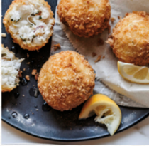
Smoked Gouda Arancini #965096, 4/25 ct

Our own mini rice balls with a melty smoked Gouda cheese center. Bake and serve. Simply Cuisine