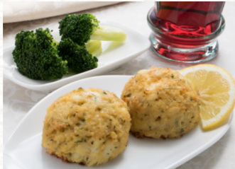
Crabcake Extra Fancy Kaptains Ketch 15/3 oz #965070