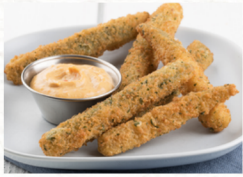
Zucchini Sticks Italian Breaded Anchor, 4/3.5 lb #801604