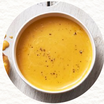
Craft Beer Cheese Dip JTM, 4/5 lb #680441