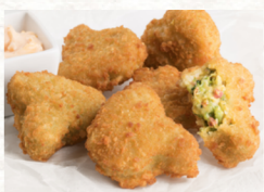
Broccoli Cheddar Bites Breaded Anchor, 6/2.5 lb #801603