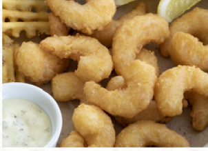
Beer Battered Shrimp Round 28/36 Tail Off King & Prince, 4/2.5 lb #480540