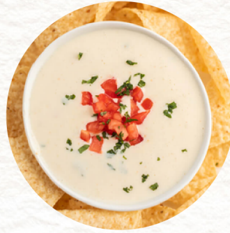
Queso Bravo White Cheese Dip Land O Lakes, 6/5 lb #060354