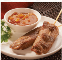
Beef Satay Unseasoned #853027, 1/100 ct

These franks feature an all-butter puff pastry generously wrapped around miniature beef frankfurters. Les Chateaux