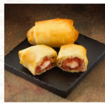
Brie Raspberry Filo #851054, 1/100 ct

This cone shaped tortilla is filled with Cheddar and Monterey Jack, heavy cream, onions, scallions, red and green peppers, coriander & spices. Les Chateaux