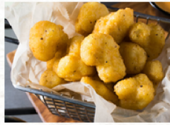
Cauliflower Battered Anchor, 6/48 oz #801502