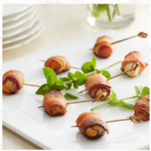
Bacon Wrapped Chicken Apricot #851116, 50/ea

Mini Taco with a blend of onions, specs of red chili and pea-size chunks of chicken wrapped in a corn tortilla. Posada