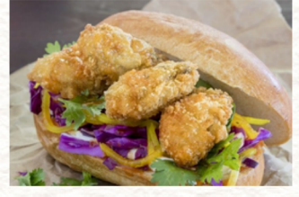
Panko Breaded Oysters Mrs. Friday's, 6/2.5 lb #965022